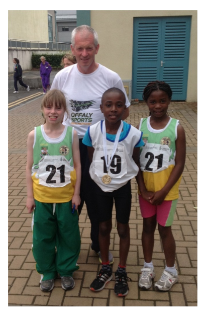
Three members of the IAAP at 2013 All Ireland Community Games with Sports Partnership Coordinator

Two coaches of migrant backgrounds with specific skills in the sports of track and field athletics continue to take their skills into the mainstream. The process of linking migrant children and families to mainstream clubs is underway. Progress in this regard will be monitored and reported on in future years.