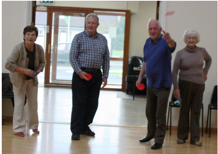
HEPA / Go for Life Games sessions