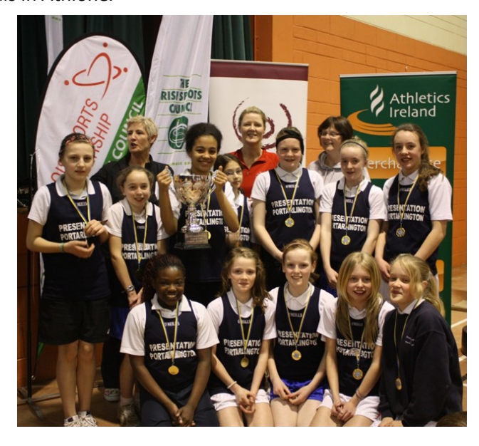
Six of the 12 member Portarlington team that won the National SPORTSHALL Athletics Finals were of a migrant background (Parentage: Jamaican, Zimbabwean, Polish, Lithuanian, Palestinian)

A further three members of the academy including one individual champion qualified to the Community Games finals in Athlone.