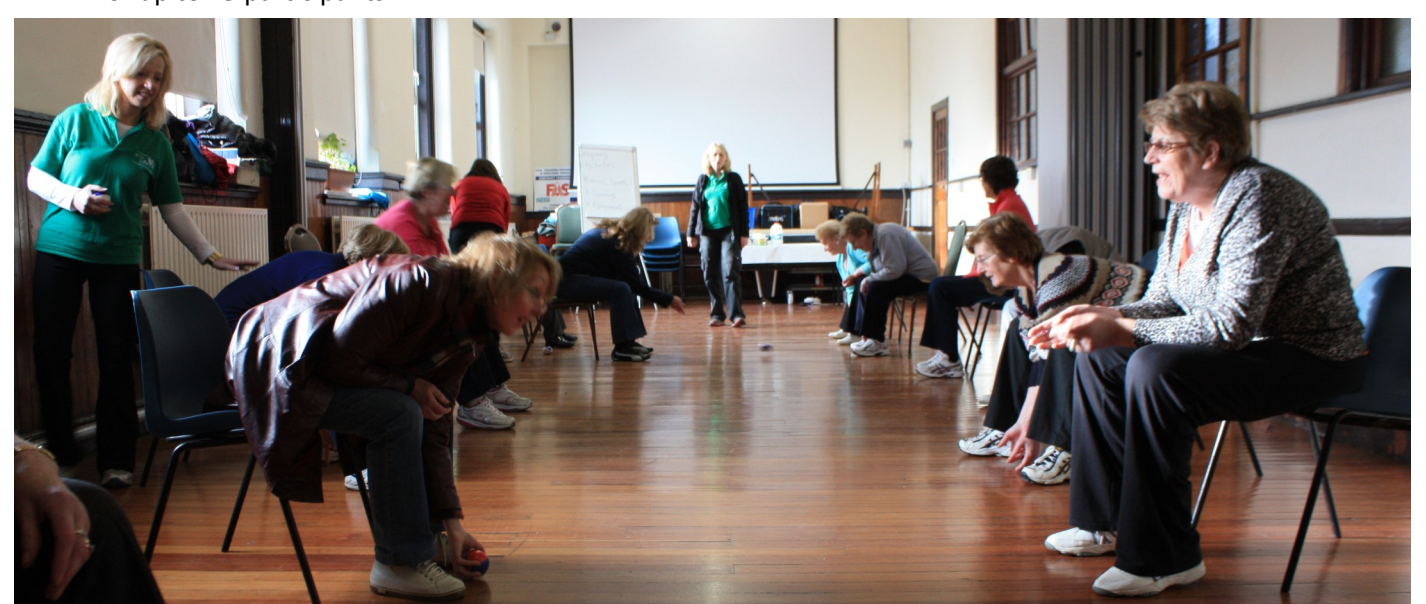
Physical activity leader training

1. Physical Activity Leader training - Offaly Sports Partnership with the support of Go for Life delivered the final five workshops in the Go for Life Physical Activity Leader training programme to 34 older people from five active retirement groups. At least 50% of the newly qualified leaders continue to lead physical activity sessions within their group on a regular basis. Following the conclusion of their training, leaders from the Tullamore Active Retirement Association began leading a physical activity session in a local hall every week for up to 25 participants.