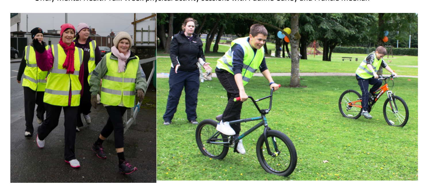
Mass participation events promoted in Offaly in 2013 -Operation Transformation Walk & Pedal in the Park (delivered as part of Bike Week 2013)