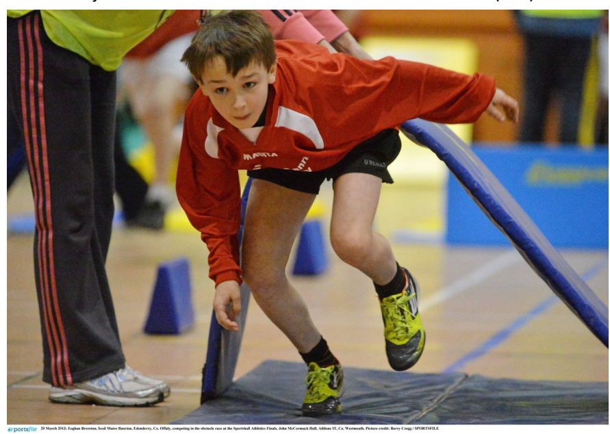
Edenderry boys going through the tunnel on the 3rd / 4th class over / under relay at the All Ireland SPORTSHALL Athletics Championships

2. 3rd All Ireland SPOTSHALL Athletics Championships : The Partnership coordinated all aspects of the third All Ireland SPORTSHALL Athletics Championships on behalf of the wider Sports Partnership Network in conjunction with the Athletics Association of Ireland (AAI) and Athlone Institute of Technology (AIT).