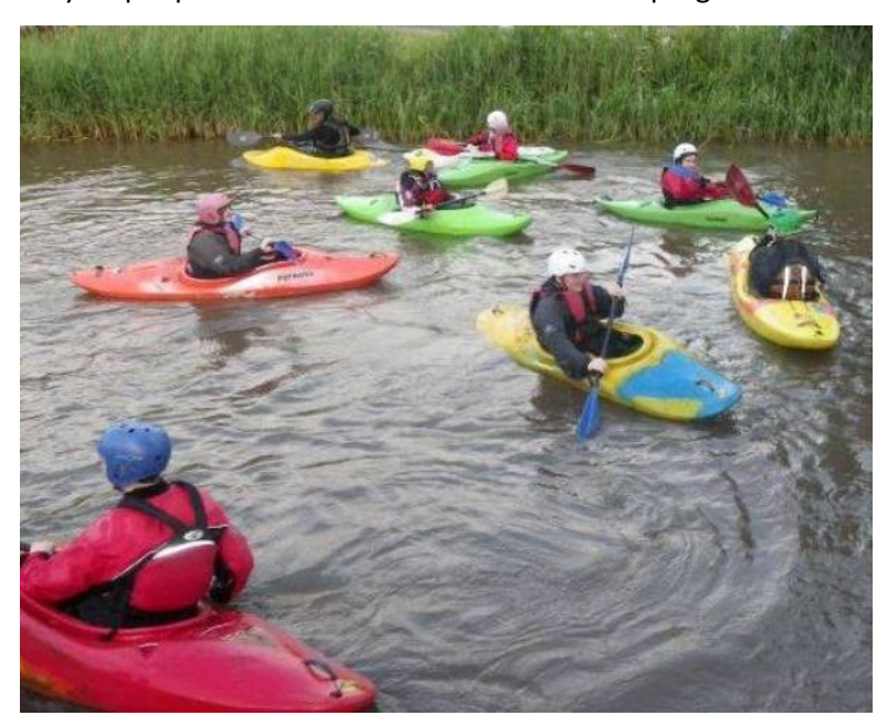
Programmes for people with disabilities (NCBI come try tandem / LOFFA come try kayak)

In addition Offaly Sports Partnership were centrally involved with the development of CARA's Xcessible Youth Initiative - Special School SPORTSHALL Athletics programme. The actual delivery of this programme commenced in January 2014.