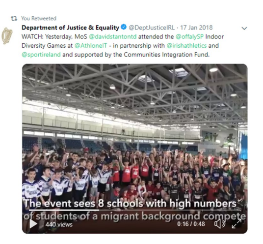
Department of Justice & Equality tweets - Diversity Games, January 2018

Following a second round of community integration project funding from the Department in 2018, Offaly Sports Partnership and the AIT International Arena hosted the second annual Diversity Games across two days in December. Almost 500 primary and post primary pupils / students were in attendance, again over half of those participating were children and young people of an ethnic minority background. We look forward to continuing to work with the Department on projects designed to increase the participation of under represents groups such as people of an ethnic minority background in sport and physical activity