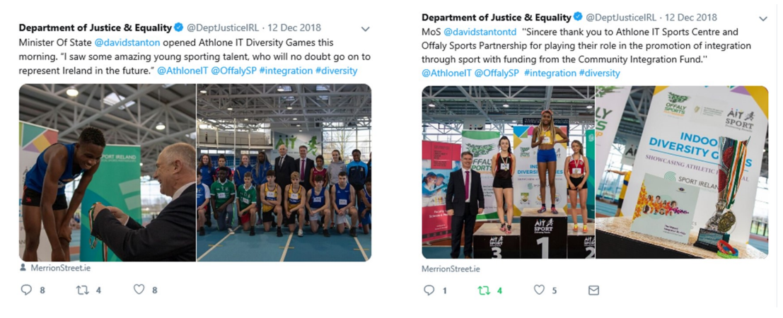
Department of Justice & Equality tweets - Diversity Games, December 2018

Following a second round of community integration project funding from the Department in 2018, Offaly Sports Partnership and the AIT International Arena hosted the second annual Diversity Games across two days in December. Almost 500 primary and post primary pupils / students were in attendance, again over half of those participating were children and young people of an ethnic minority background. We look forward to continuing to work with the Department on projects designed to increase the participation of under represents groups such as people of an ethnic minority background in sport and physical activity