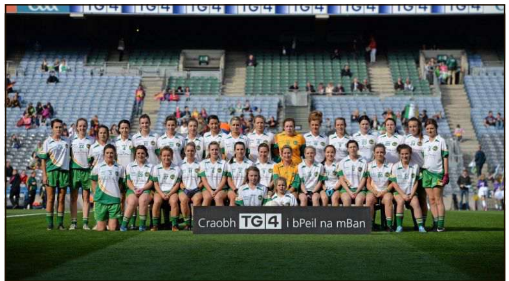
The Offaly squad that won the All-Ireland junior ladies football title in 2013