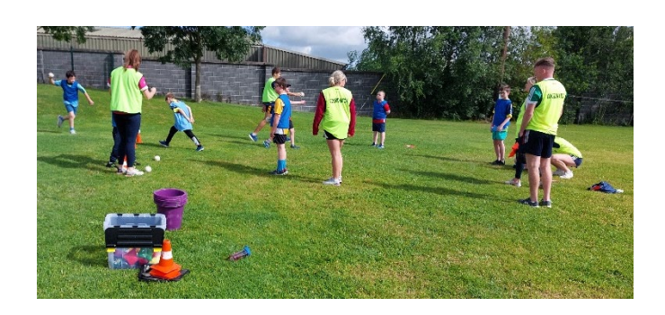
Arden View summer camp

I facilitated a series of sport and physical activities on a summer camp for 25 children in Arden View.