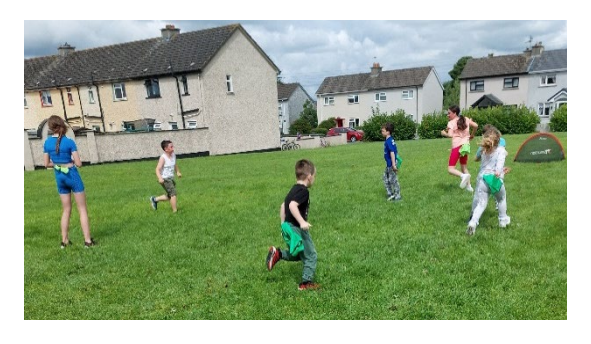
Games on the green / Community sports' days