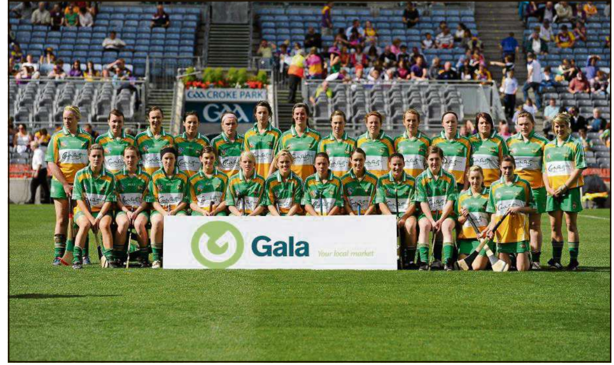
The Offaly squad that won the All-Ireland camogie intermediate title in 2010.

It was in the 1930s before camogie began to thrive in Offaly as clubs were formed in areas such as Lusmagh, Ballycommon, Mucklagh, Ballycumber, Killoughey, Rahan, Drumcullen, Kinnitty and Tullamore Rahan, - it is interesting to note that some of those areas, especially Ballycommon and Ballycumber, are ones where there was not a male hurling tradition but camogie teams were fielded. It probably represented the desire of women to play an indigenous Irish field sport and it was the 1970s before ladies football got established.