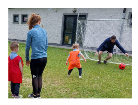
July provision days