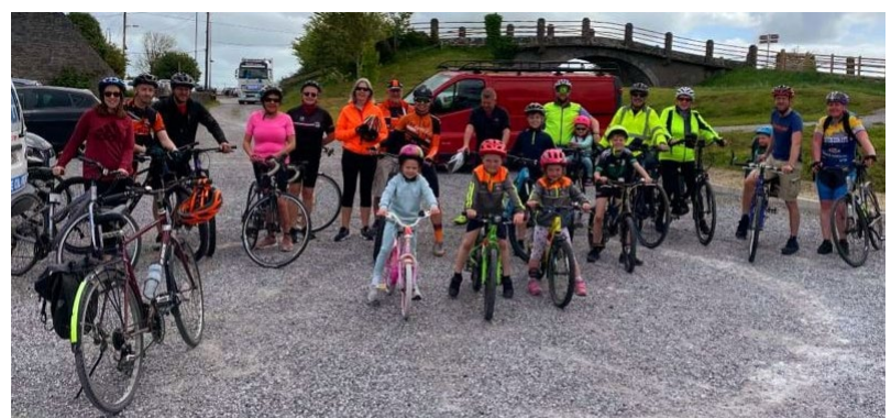
Bike week activities 2022