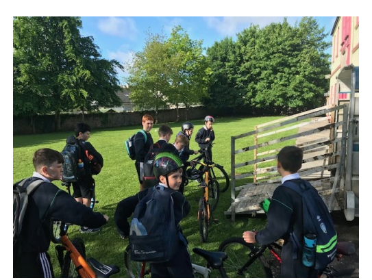
St Brendan's Boys National School, Birr